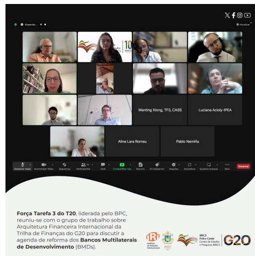
Força Tarefa 3 do T20, liderada pelo BPC, reuniu-se com o grupo de trabalho sobre Arquitetura Financeira Internacional da Trilha de Finanças do G20 para discutir a agenda de reforma dos Bancos Multilaterais de Desenvolvimento (BMDs).